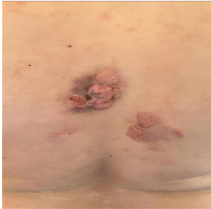
Figure 1 Initial Clinical Presentation. Photograph of the patient's upper back showing the dominant, mammillated, erythematous tumor (5 cm) with central crusting and an adjacent smaller satellite plaque

plaques (3 cm in greatest diameter) on the posterior thorax (Figure 1). No palpable lymphadenopathy was detected in the cervical, axillary, or inguinal regions.