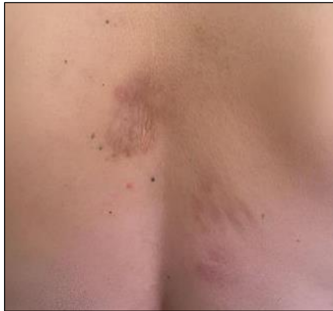
Figure 4 Post-Treatment Clinical Outcome. Photograph taken at the 3- month follow-up visit showing the treated site. The tumor has completely regressed, leaving a flat, atrophic, and finely wrinkled scar

The patient was evaluated three months after completing radiotherapy. Clinical examination revealed complete resolution of the initial tumor and plaques. The treated area presented with a flat, atrophic scar and a "cigarette-paper" wrinkling appearance, consistent with expected post-radiotherapy changes, with no induration or residual erythema suggestive of active disease (Figure 4).