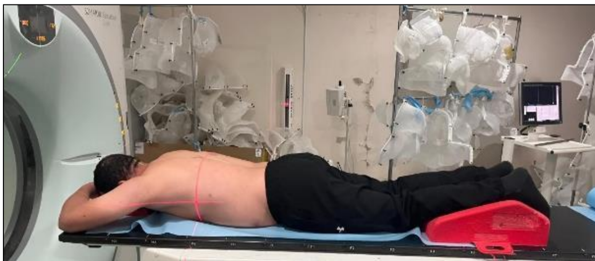
Figure 3 Patient Setup for Simulation. Photograph of the patient positioned prone on the CT simulation table. Immobilization is provided by a knee rest and a headrest. Skin marks and the central positioning laser delineate the area to be treated

For treatment planning, the patient was positioned prone on a CT simulator. Careful immobilization was ensured using a knee rest and a headrest, and the treatment fields were marked on the skin (Figure 3).