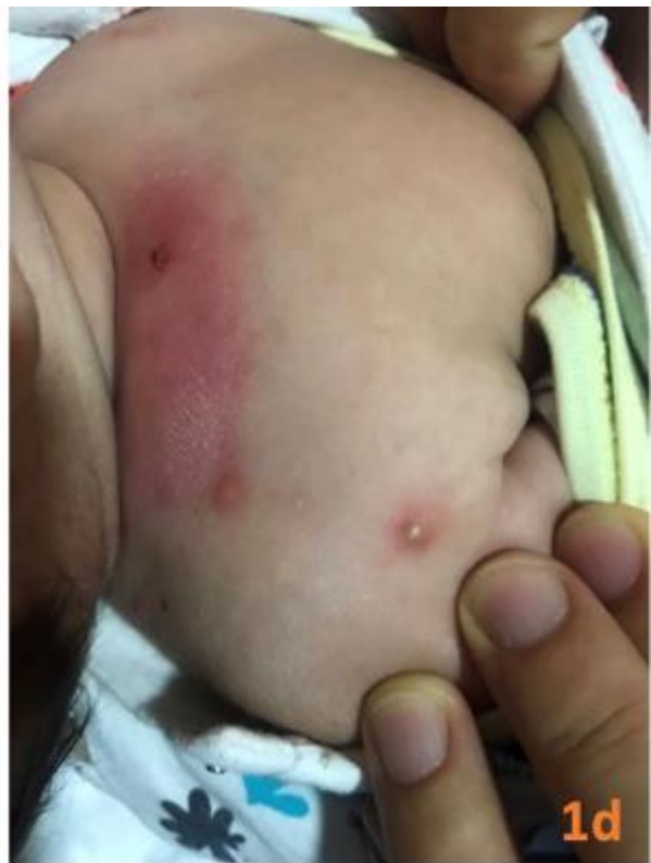
Figure 1d: Erythematous plaque surmounted by a hemorrhagic crust, associated with an isolated pustule below the lesion.