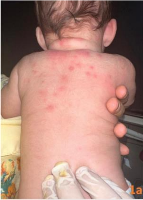
Figure 1a: Multiple erythematous papules and nodules distributed over the back.