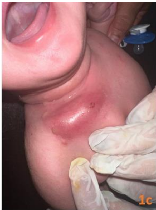
Figure 1c: A 5 cm erythematous, fluctuant swelling with spontaneous purulent discharge on palpation