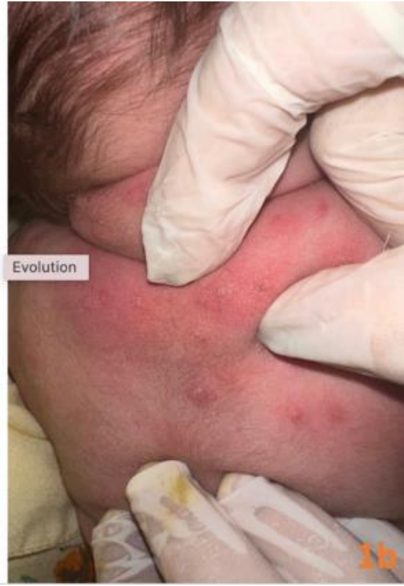
Figure 1b: A 2 cm firm erythematous nodule with a central honey-colored crust.