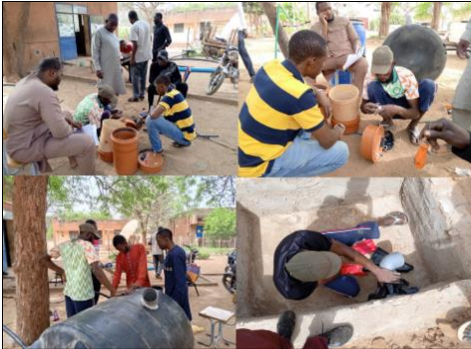
Figure 1 Confection of the recycle materials