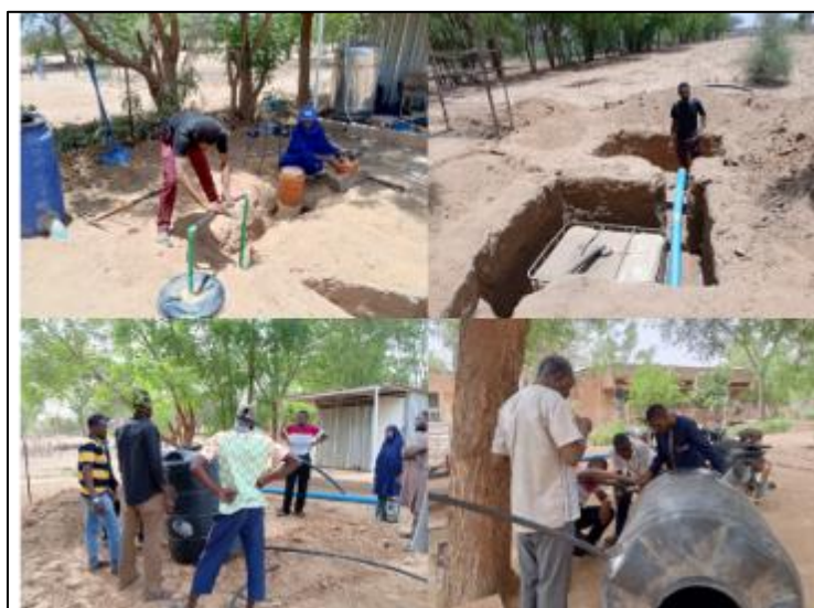
Figure 2 Dispositive of the biodigester