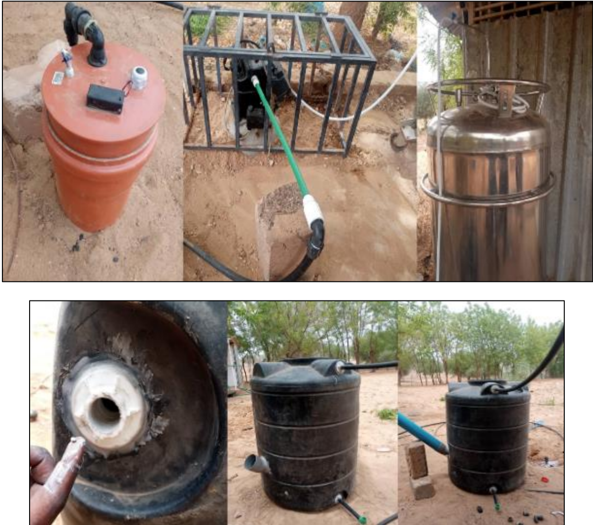
Figure 3 Materials composite the biodigester

To handle the products of digestion, an output system is constructed to collect the digestate, a nutrient-rich residue that can be used as organic fertilizer for crops. At the same time, airtight pipes are connected to the drums to capture the biogas released during the process. The collected gas can then be stored or directed for practical uses such as cooking or lighting, turning organic waste into both renewable energy and sustainable fertilizer.