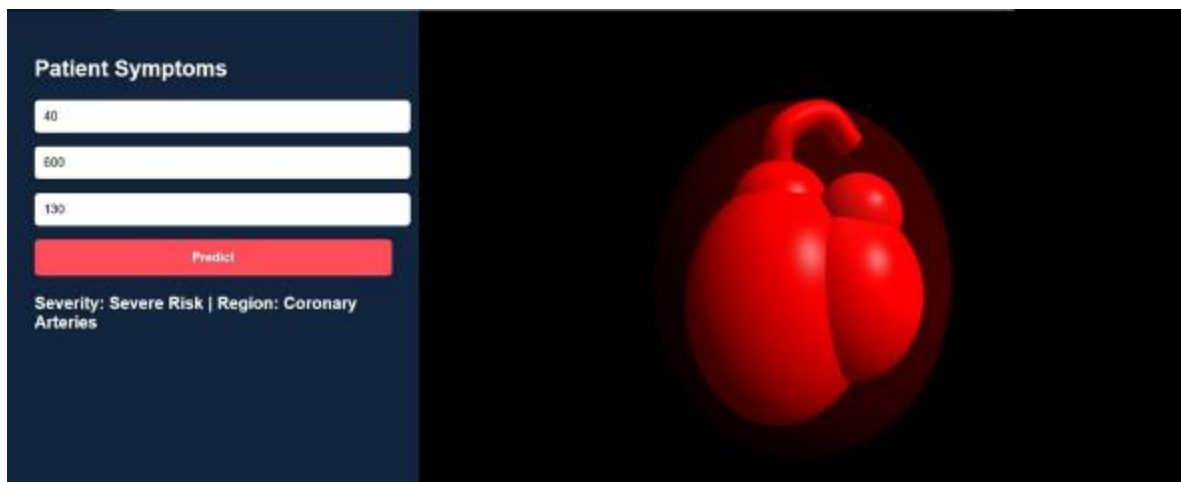
Figure 5 Severe Risk Identification in Coronary Arteries using CardioTwinX