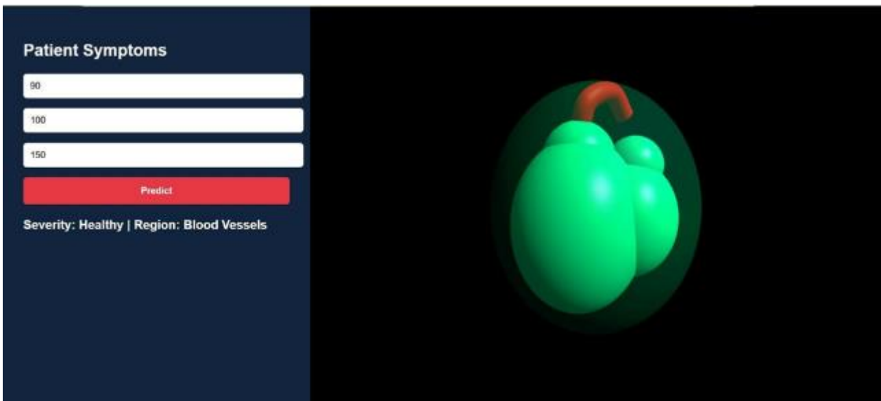
Figure 3 Healthy Heart Condition Prediction using CardioTwinX