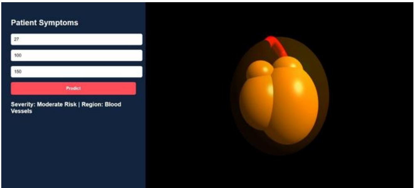
Figure 2 Moderate Risk Prediction in Blood Vessels using CardioTwinX