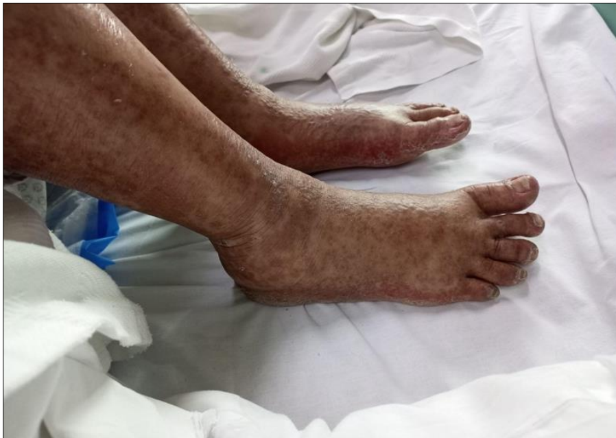
Figure 2 TEN Lower Limb showing Necrotic Epidermis (Dark discoloration)