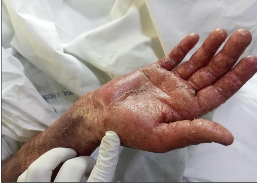
Figure 1 TEN hand showing Widespread Erythema and Rash, Ruptured bullae and Skin Detachment

On presentation the patient findings have been discussed below.