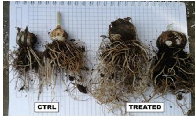
Figure 3 Effect of Azospirillum brasilense on roots growth, treated (right), control (left)