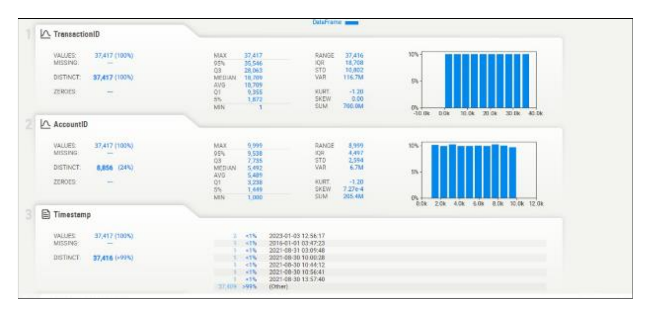
Figure 2 Image shows detailed Data Distribution for TransactionID, AccountID, and Timestamps

statistics can be useful in fraud detection as they can be used to denote patterns that are out of the ordinary and could be indicative of fraudulent practices thus improving business security by offering a more effective way for monitoring business transactions.