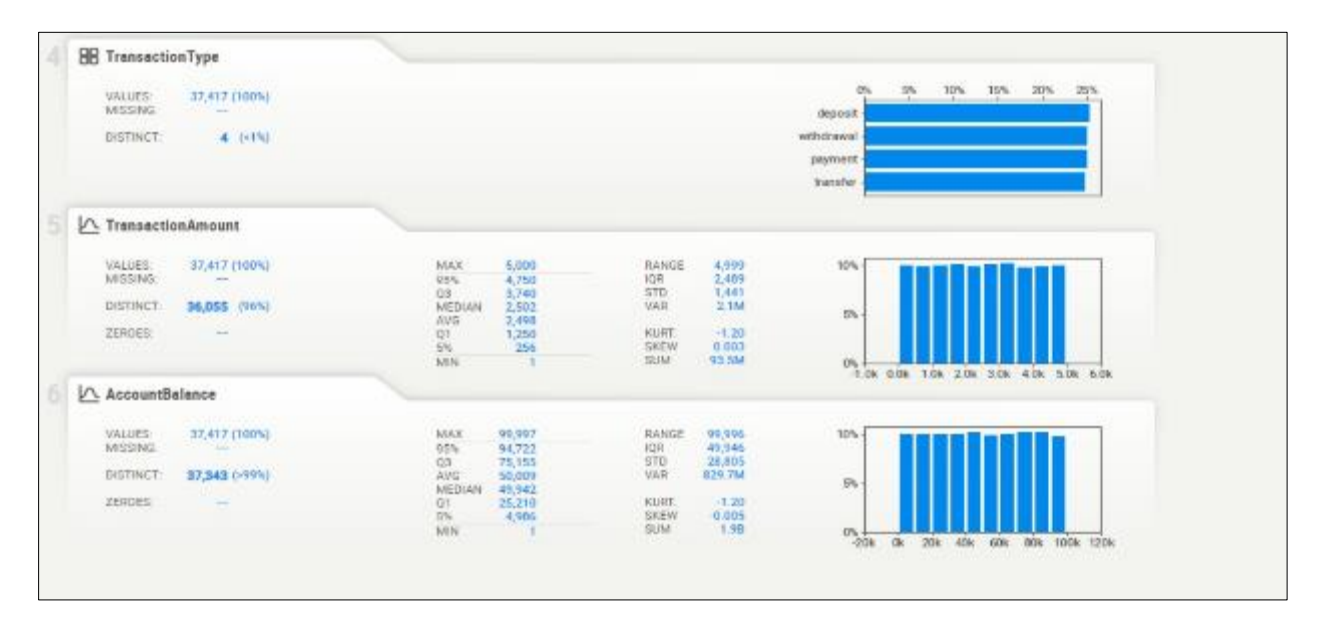
Figure 1 Statistical overview of Transaction type, Transaction amount, and Account balance for Fraud detection analysis

Statistics Before going through the features and models of the machine learning techniques, it is crucial to gain an understanding of the data. This database consists of 37,417 transactions which are redeposited across different accounts (AccountID) and the timestamps (Timestamp) by which they are recorded. The field entailed as TransactionID is equally very distinct and complete, reconfirming on the aspect that every transaction was unique. But, looking at the AccountID field, one can notice that there are 8856 distinct accounts, which means that some accounts have more than one transaction. The Timestamp values show that this dataset covers a rather long period, and each transaction contains the timestamp, which means that temporal analysis can be performed on it. The range, quartiles, mean, and standard deviations of the data presented in the above table show that these fields do not possess any skewed distribution for any of these fields, as evident in the values of skewness that are, for most of the fields, very close to zero. These results can be interpreted as minimal departure from Gaussian distribution as all the fields have the kurtosis values close to 3.