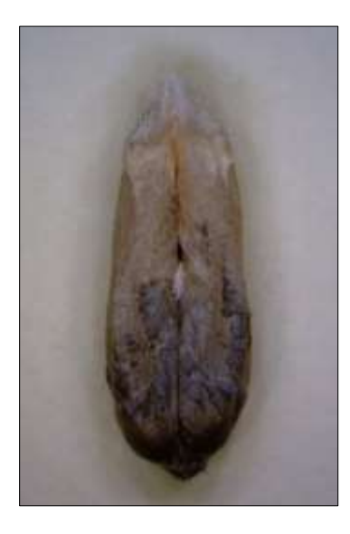
Figure 1 Wheat grains affected by Tilletia indica , showing the characteristic lesion caused by the fungus

germination decreases depending on the extent of infection of grains. Also, Rai and Singh op. cit. reported that severely infected grains lose viability or show abnormal germination; on the other hand, Fuentes-Dávila et al. [17] found that grains with the greatest extent of infection, but with the embryo intact, produced the highest number of tillers. Economic losses to wheat farmers and to the milling industry are due to the negative effect of the disease on seed and flour quality, as well as the national and international quarantines that have been implemented [18,19,20].