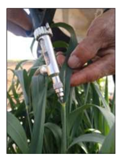
Figure 3 Inoculation by injection with Tilletia indica , during the boot stage of the wheat plant

Inoculum was prepared as described by Fuentes-Bueno and Fuentes-Dávila [56]. Commercial rates indicated in the containers of each product were followed: Opus SC (BASF, epoxiconazol 12 % a.i. in weight) as the regional check 1 L ha<sup>-1</sup> [57], Tacora 25 EW (Gowan, tebuconazole) 0.60 L ha<sup>-1</sup> [58], Velficur 25 EA (Velsimex, tebuconazole) 0.60 L ha<sup>-1</sup> [59], and Zoll 500 SC (FMC, tebuconazole) 0.30 L ha<sup>-1</sup> [60] (Table 1). For application of fungicides, a manual Solo backpack sprayer (15 L) was used with a single nozzle, and the volume was based on 250 L of water/ha. To avoid the carryover of the products applied, plastic barriers were used in each plot during the applications.