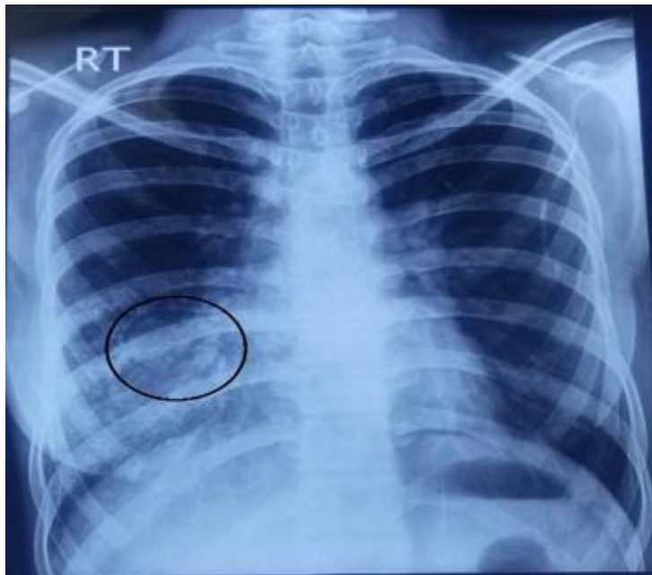
Figure 1 Chest X-Ray showing right lower lung opacity with an air crescent sign (encircled in black)

On workup, a chest X-ray (Figure 1) showed heterogeneous opacity in the right middle zone with an air crescent sign, pathognomonic of aspergilloma lung. A 5.5-cm mass in the right middle lobe with cavitation and an intracavitary mass adherent to the pericardium were discovered on the chest Computed Tomography scan (CT Scan). (Figure 2).