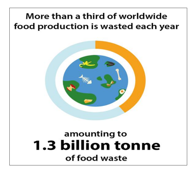
Figure 1 1.3 Billion Tonnes of Food Waste [1]

energy. Moreover, the disposal of food waste contributes significantly to greenhouse gas emissions, with estimates indicating that food waste accounts for around 8-10% of global greenhouse gas emissions (IPCC, 2019).