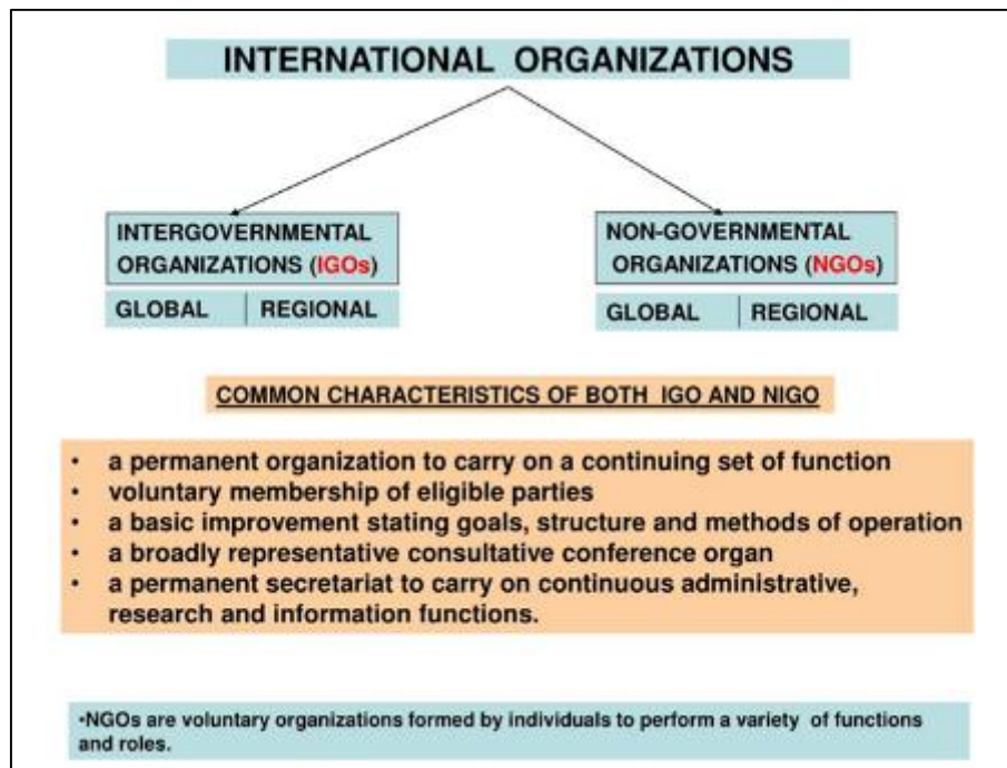
Figure 1 Structure of International Organisations[1]

In this increasingly interconnected world, no single nation can effectively address global security threats on its own. This has led to a greater reliance on international organizations that can coordinate multilateral efforts to manage and resolve conflicts, promote peace, and provide humanitarian assistance.[2] Organizations such as the United Nations (UN), the North Atlantic Treaty Organization (NATO), and the European Union (EU) play crucial roles in bringing together diverse nations to address these challenges. Their ability to leverage collective resources and foster international cooperation makes them indispensable in the quest for global security.