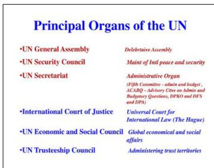
Figure 3 Principal Organs of the UN

The UN's structure includes several key organs that are directly involved in maintaining global peace and security. The most prominent of these are the UN Security Council (UNSC), the General Assembly, and the International Court of Justice, each playing distinct but complementary roles in the UN's security apparatus.[10]