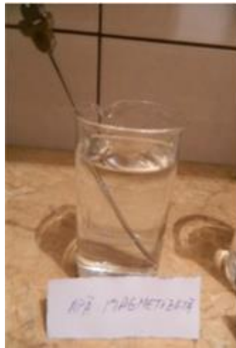
Figure 2 Grander informed water