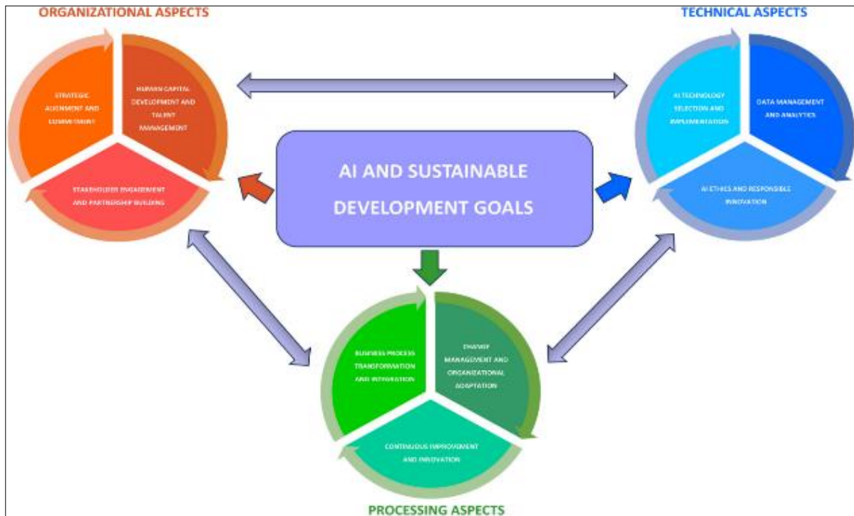
Figure 2 Conceptual Model For Integrating Ai Into Sustainable Development. https://onlinelibrary.wiley.com/doi/10.1002/sd.2773

groups using machine learning and shallow text processing under the processing aspects, therefore providing teachers with information about learners' conversations and support for encouraging learners' involvement and learning.