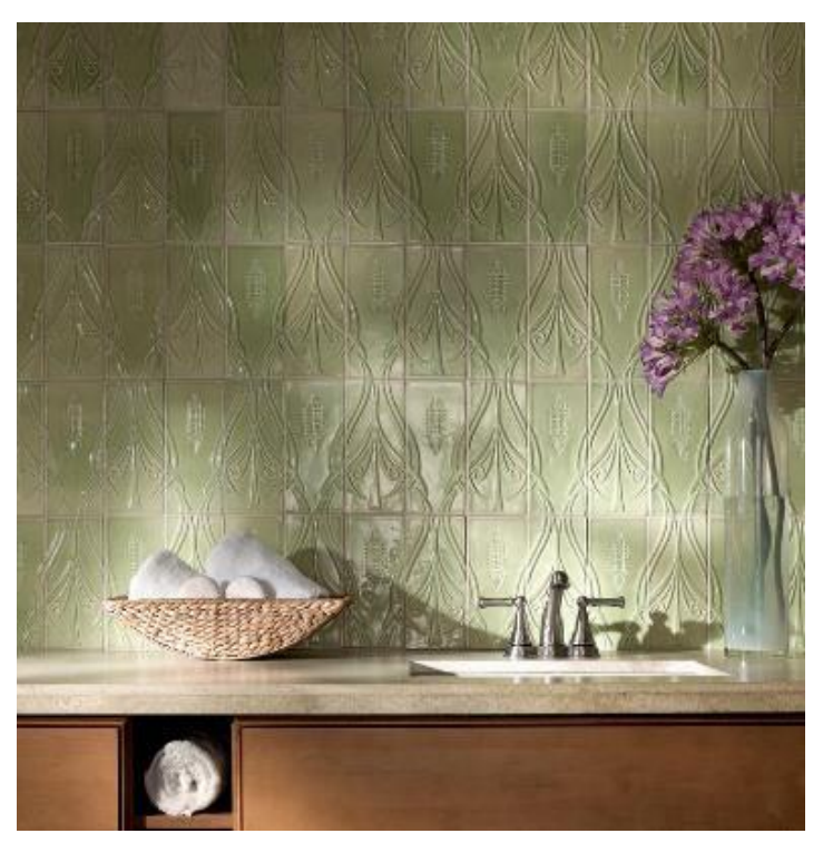
Figure 1 Toilet by Marsh and Clark Design [1]