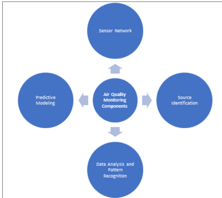
Figure 3 Schematic of key components of Air Quality Monitoring

For sensor networks, the traditional approach uses conventional monitoring stations with periodic data collection. And for the AI Integration there is deployment of AI-powered sensor networks for continuous, high-frequency data collection. Machine learning algorithms process this data in real-time, allowing for more granular insights into air quality variations. Similarly for data analysis and pattern recognition, the traditional approach relies on manual data analysis and predefined thresholds. The AI Integration utilizes machine learning algorithms for data analysis, AI systems can identify complex patterns and trends in air quality data. This enables the detection of subtle changes and the prediction of pollution events before they reach critical levels. Source Identification, for the traditional approach there is difficulty in pinpointing specific sources of pollution. However, the AI Integration uses AI algorithms, including machine vision and deep learning, can analyze data from various sources, such as satellite imagery and traffic patterns, to identify and attribute pollution sources. This aids in targeted interventions and regulatory actions. Predictive modeling, the traditional approach uses reactive responses to observed air quality issues. AI Integration uses predictive modeling based on historical data, meteorological conditions, and other factors allows for forecasting air quality changes. This enables proactive measures and timely public health interventions.