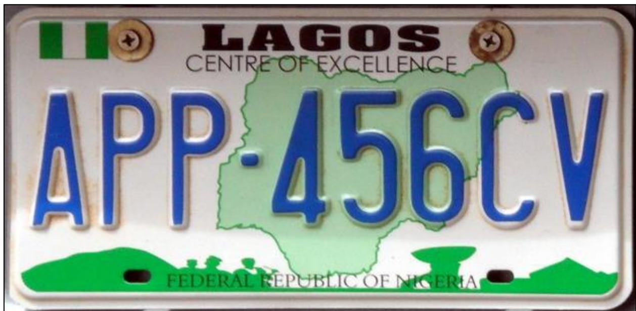
Figure 2 Nigeria plate number (Wikimedia, n.d)

An ANPR with Nigerian number plates based on its configuration makes it much easier to track criminal masterminds in real-time. Nigerian number plates have a white background and the number can be in either red, blue, or green, representing commercial, personal, and government entities respectively in the top left. This is where the Nigerian flag is located while the state registers a number and has its slogan displayed in the top center of the plate. The unique way Nigerian license plates have been configured makes them easy to use with ANPR as security applications. The plate is a combination of format ABC-123DE; The first three letters indicate the municipality in which the license plate is registered, followed by a unique three-digit number for the vehicle and two letters. With growing cases of kidnappings across the country and the unique way the license plates are configured, ANPR tracks vehicles of interest in the police database and could achieve real-time interception.