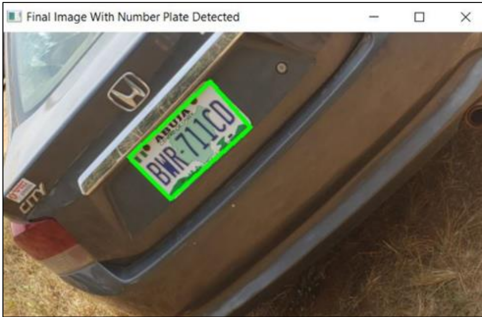
Figure 7 License plate number detected (author, 2023)