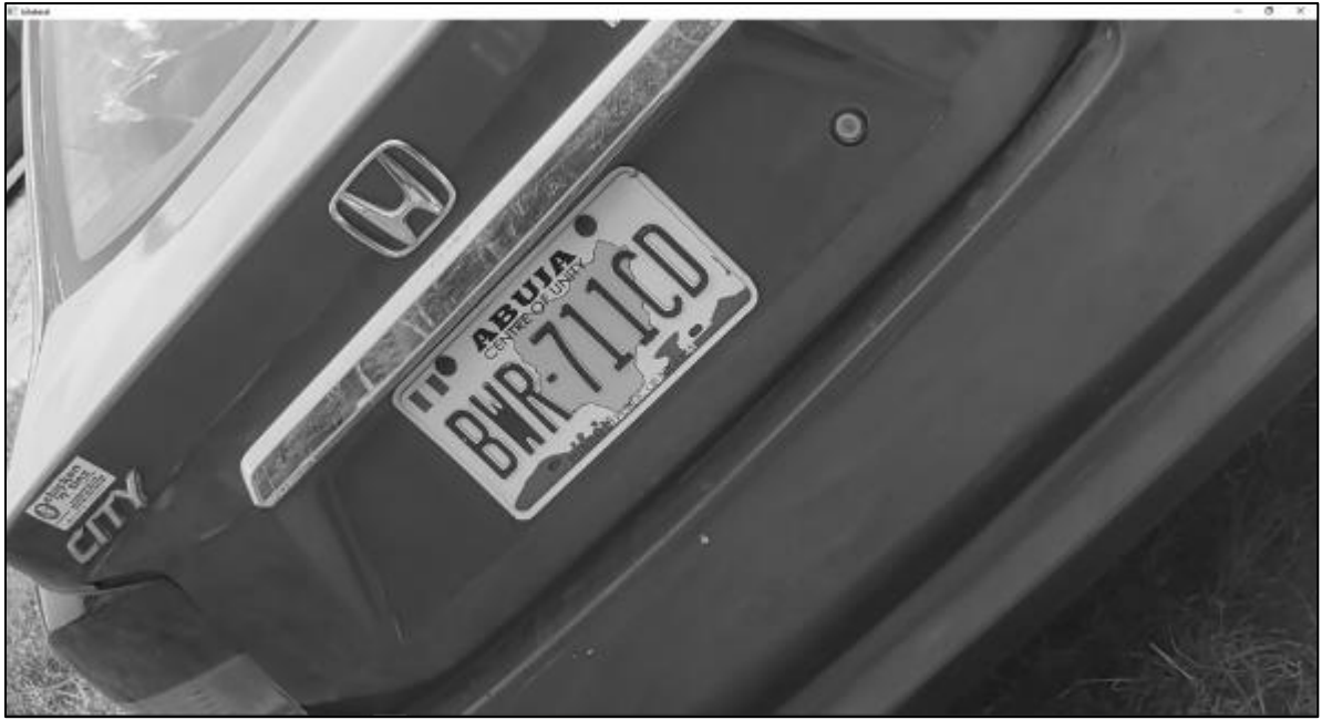
Figure 5 Bilateral filtered image(author, 2023)