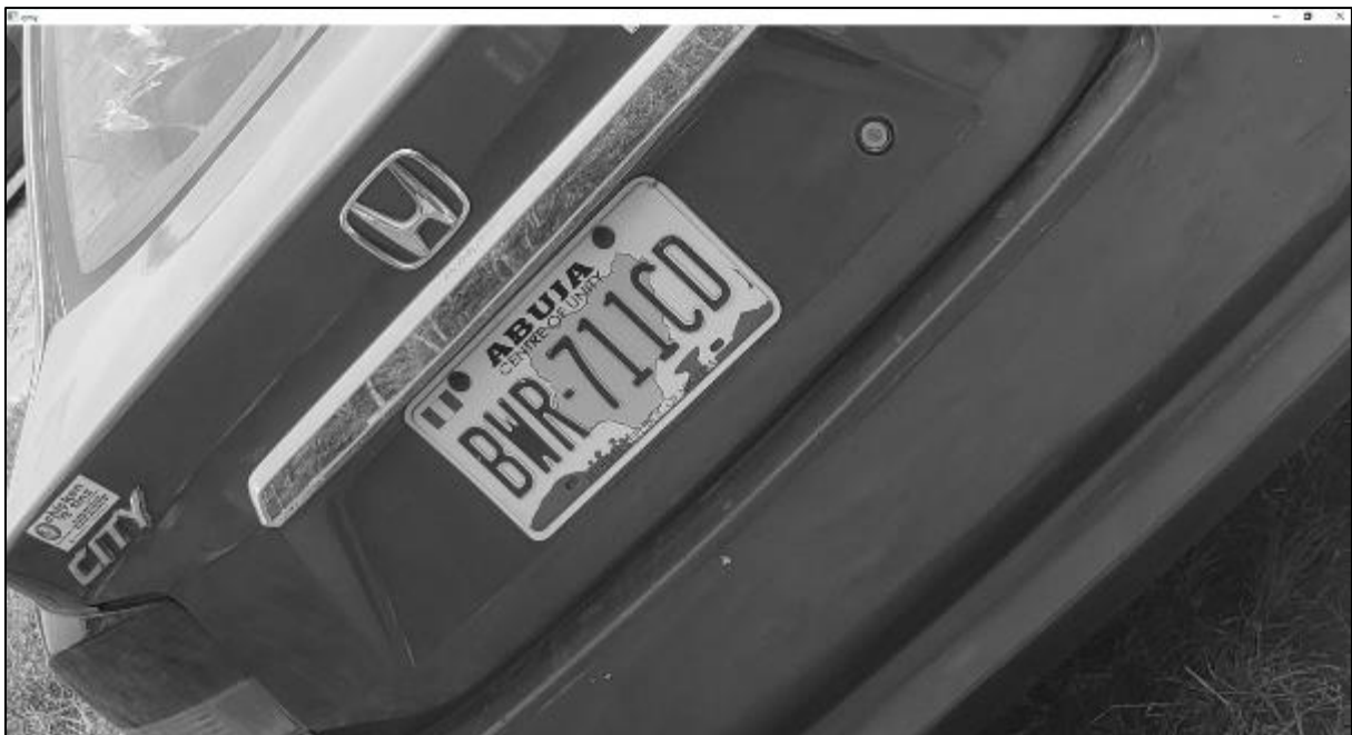
Figure 4 Gray image