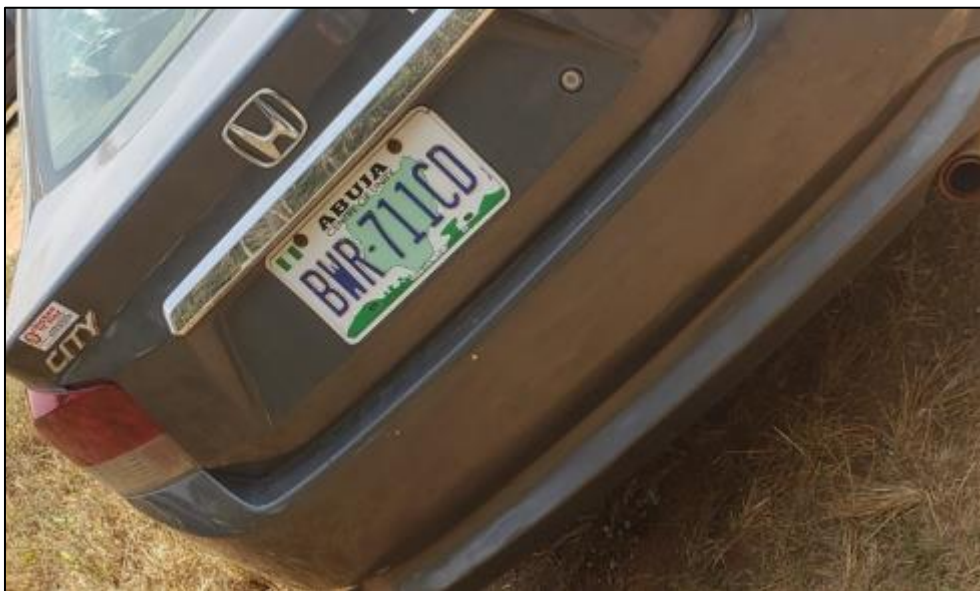
Figure 8 Undetected license (author, 2023)

The rest of the code is found in Appendix 1