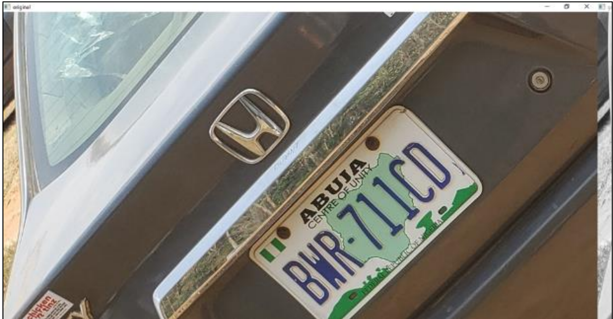
Figure 3 Original colored car image(author, 2023)

OpenCV does not support the native RGB channels on which images are saved; Grayscale becomes important in others for us to manipulate the image, find contours and recognize license plates. Grayscale is the process of converting an image from other color spaces, e.g. RGB, CMYK, HSV, etc. up to greyscale. It varies between all-black and all-white (geeksforgeeks, 2023). The importance of grayscale images of a vehicle is that we can work with a single-channel image as supported by OpenCV.