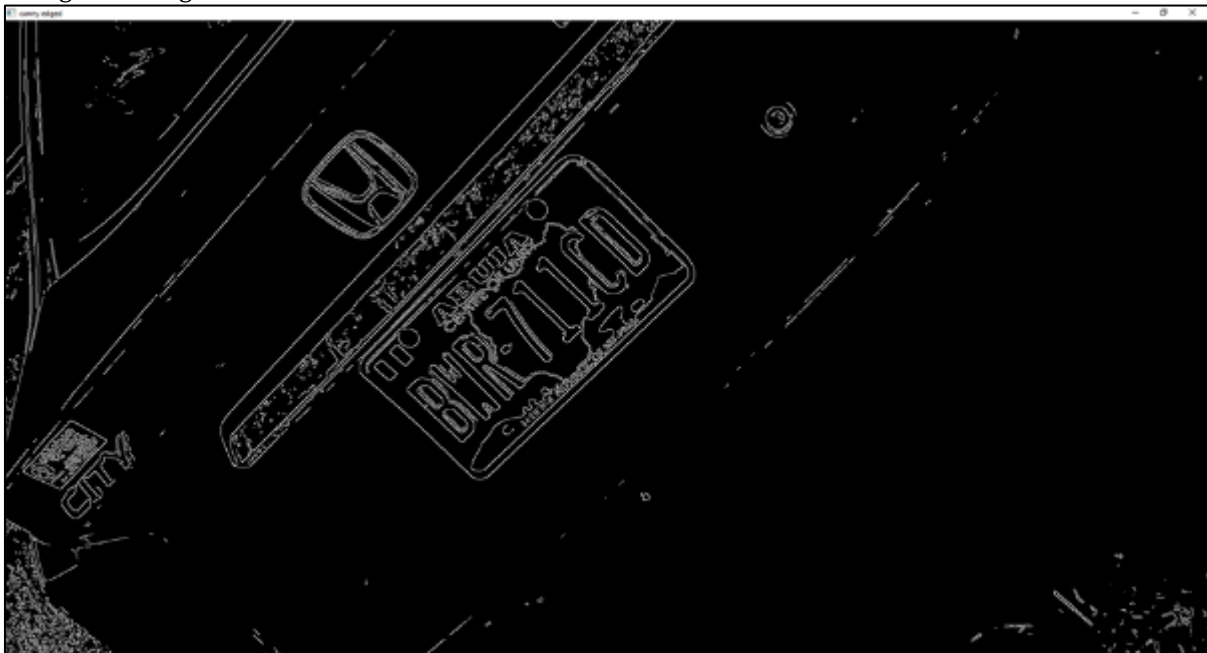
Figure 6 Canny-edged detection(author,2023)