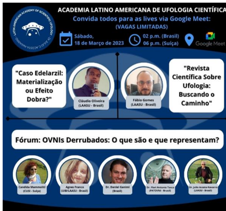
Figure 1 Poster announcing the international virtual meeting “Forum OVNIS derrubados o que são e que representam?”, March, 2023, São Paulo, Brazil.

to discuss this subject on March 18, 2023. Five professionals from different academic fields were invited to give their points of view (Figure 1).