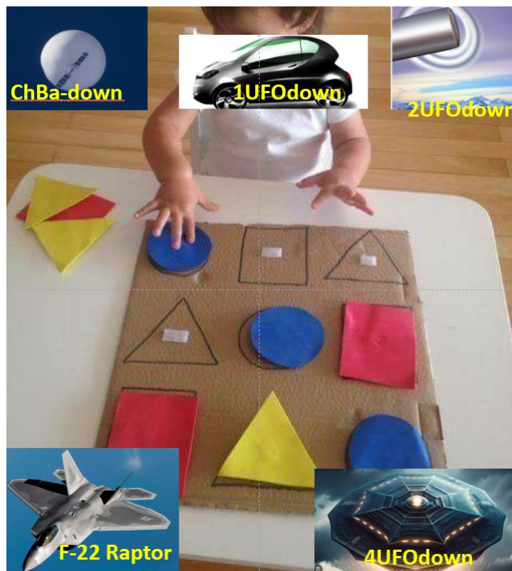
Figure 6 Image representing the central hypotheses of this study

The four UFOs shot down could be low-tech extraterrestrial machines, described in some cases as flying at 32 and 64 km/h, posing no danger.[61]. Unlike the incidents with aircraft carrier jets presenting flight capabilities that, as far as is known, no terrestrial ship could have.