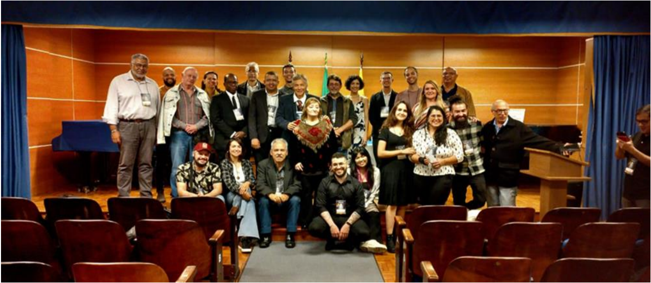
Figure 3 Last face-to-face meeting of the team of members and collaborators of Latin American Academy of Scientific Ufology (LAASU), a non-governmental organization non-profit, in São Paulo, June 2023, Brazil.