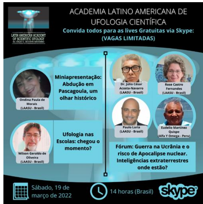
Figure 5 Poster announcing the international virtual meeting “Fórum: Guerra na Ucrânia e o risco de Apocalipse nuclear: Extraterrestres onde estão?” March, 2022, São Paulo, Brazil.

Relations between Russia and the United States, long strained, have worsened even further since Russia's invasion of Ukraine last year. In February, Moscow pulled out of the New Strategic Arms Reduction Treaty (START) nuclear arms reduction treaty with Washington. Both the United States and Russia - by far the world's largest nuclear powers - have said that a nuclear war can never be won and must never be fought, but the conflict in Ukraine has raised fears of a direct confrontation with the West.[47]