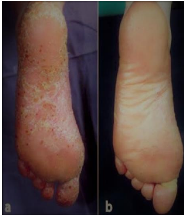
Figure 2 Sole region Psoriasis before and after treatment