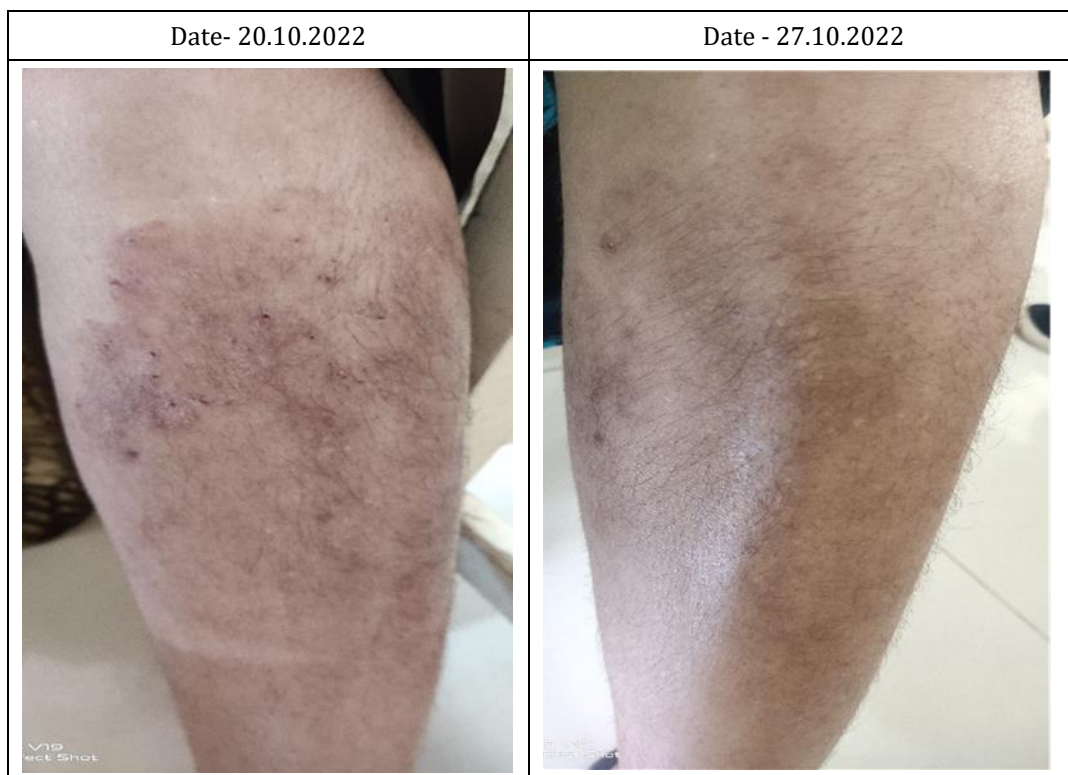
Figure 1 Before treatment and After treatment photographs

Clinical examination of the patients revealed regression of all symptoms within 7 days.