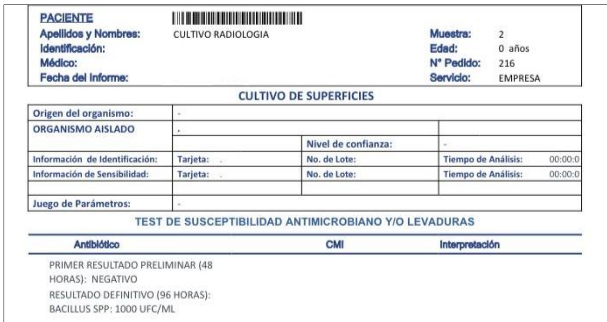
Figure 4 Incubation results at 96 hours (Radiology)