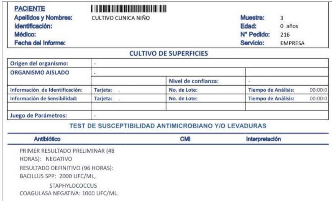
Figure 5 Incubation results at 96 hours (Child's Clinic)