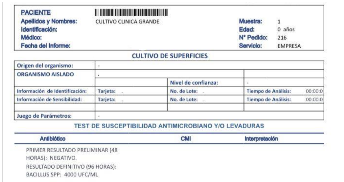
Figure 3 Incubation results at 96 hours (Adult Clinic)