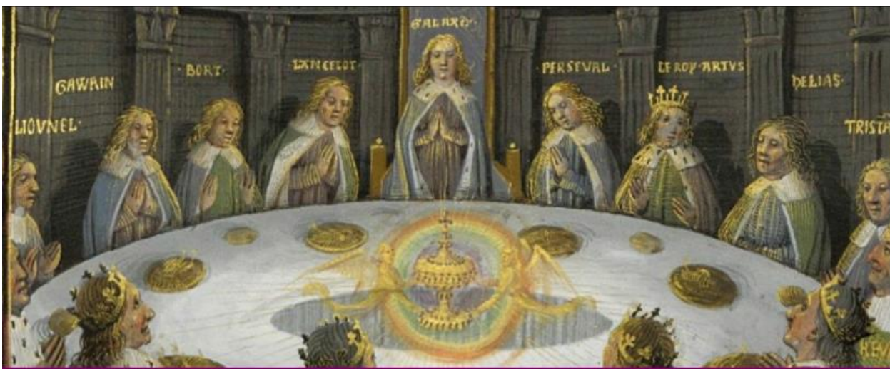
Figure 1 Knights of the kingdom of Camelot

Camelot is shown to possess a very powerful military led by the Knights of Camelot. Their coat of arms is a golden dragon on a red background. Knights and high-ranking officers wear red cloaks over their armour and archers seemed to be armed with crossbows. As said by Cenred, "...they have a reputation as a fearsome fighting force." Morgana also states that the Knights of Camelot are "...famed as the greatest knights in five kingdoms" (The Sword in the Stone, part 1) even Helios a great warrior himself stated without the Siege tunnel plans an attack on Camelot would be suicidal. Also, it was because of the Knights the kingdom did not fall to Cenred's army despite them being outnumbered two to one, however, this must be attributed to the fact that the knights are professionally trained and Cenred had a mostly mercenary army and the castles formidable defences. Because the kingdom fell to Morgause and Morgana's army, it can be assumed that most of Camelot's army was destroyed fighting the immortal army. They were replaced with the Blood Guards and Cenred's immortal army until Arthur and the Knights of the Round Table took back the kingdom and rebuilt their forces [6].