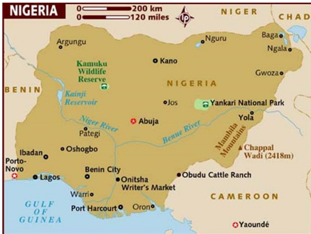
Figure 1 Map of Nigeria showing the three regions by the intersection of the Niger River.

Nigeria is the most populous country in sub-Saharan Africa with an estimated area of 923,773 km 2 [14, 15]. comprising of 36 states and a population of 152 million people. Based on natural landscape, Nigeria is divided into three regions namely: Northern region, Western region and Eastern region, by the intersection of the River Niger and the River Benue (Figure 1) before terminating into the Gulf of Guinea [16]. The geographical location of the Federal Republic of Nigeria is on the Gulf of Guinea in the West Africa.