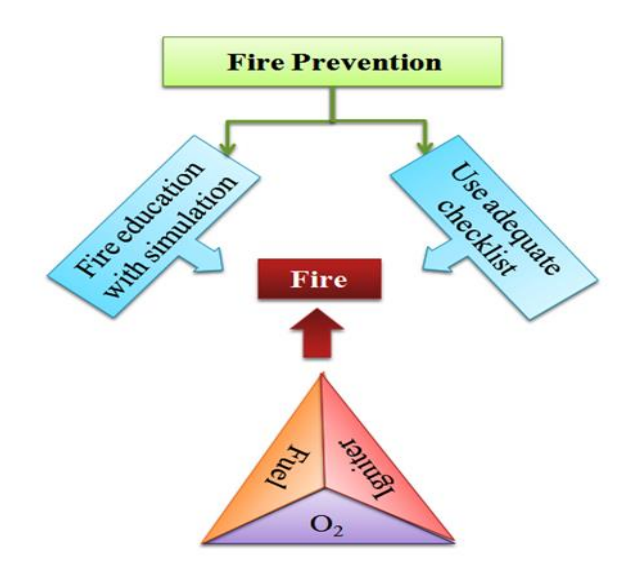
Figure 2 Fire safety prevention models in ORs