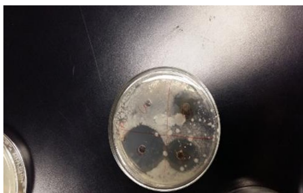
Figure 1 Zone of inhibition of both the drugs against Staphylococci

Note: C- Cynodon dactylon M- Murraya koenigii Sample 1 - 1:2 (M:C) = 40mg/ml:80mg/ml Sample 2 - 2:1 (M:C) = 80mg/ml:40mg/ml