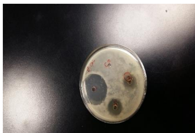
Figure 2 Zone of Inhibition of both drugs against Escherichia coli