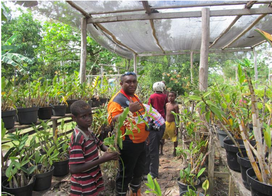
Figure 4 Orchid’s nursery runs by locals who inhabit the national park.