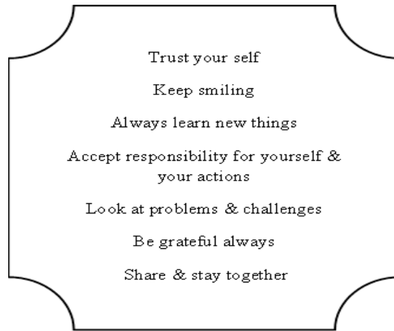
Figure 3 Leadership Skills