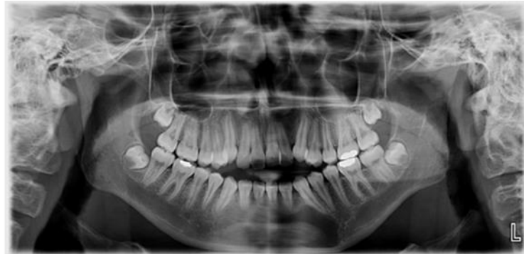
Figure 1 Preoperative panoramic radiographic image

A 14-year-old female patient was referred to the Eskisehir Osmangazi University Faculty of Dentistry Department of Oral and Maxillofacial Surgery for evaluation of an unilocular radiolucency of mandibular symphysis which was discovered as part of routine radiographic examination (Figure 1).