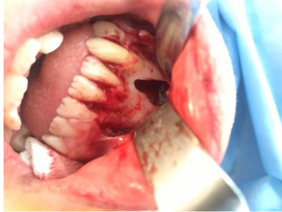
Figure 4 Perioperative intraoral image

Curettage was made for haemorrhage and the flap was closed with 4–0 silk suture. The healing was uneventfully.