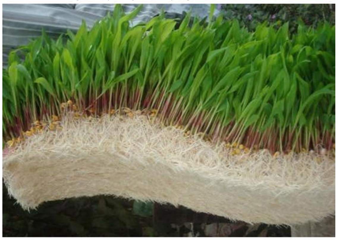
Figure 2 Hydroponic fodder with roots